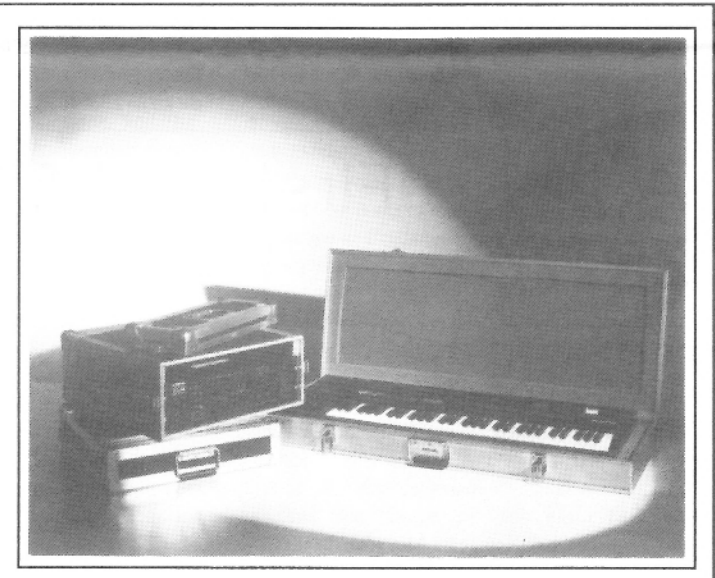
Shown: 4-space rack with EPS-16 PLUS module, 2-space rack, Eagle-I VFX-sd case

8:00 am to 4:30 pm CT, Mon. – Fri. We accept: COD, Visa, Mastercard, American Express. Dealer Inquiries Welcome!